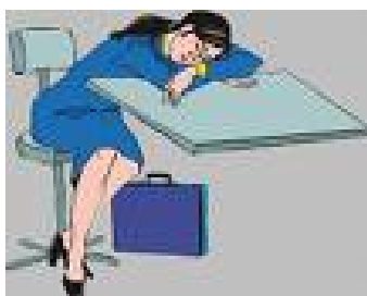
Dareemid daal sabab la'aan ah

IMPORTANT: If you have ANY of these problems call your clinic or Public Health Nurse (218) 998-8336 right away – don't wait for your next appointment.