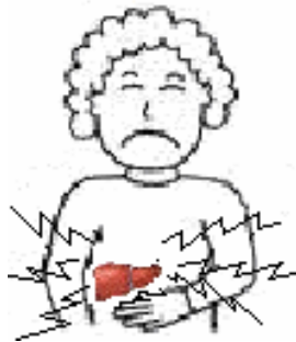
Xudunta oo ku xanuunta