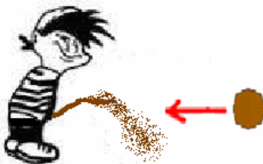
Kaadida oo ku madowaata (midabka shaaha ama qaxwaha)