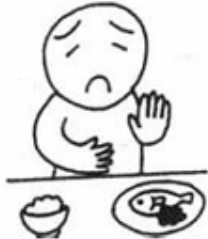
Rabitaan la'aan cunada