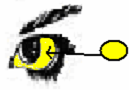
Nabarrada maqaarka ama cun-cunka Maqaarka oo yeesha midabka hurudka ama indhaha