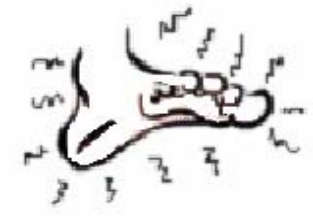
Kowaabiyo iyo qarar oo aad ka dareemaysid gacmahaaga ama cagaha